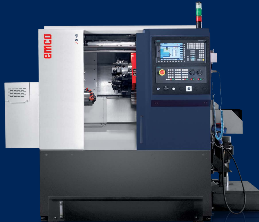
Machine with optional equipment

The compact CNC lathe with turn-mill turret is predestined for processing bar parts with a diameter of up to 45 mm and chuck parts of up to 220 mm. The main spindle features speeds of up to 6300 rpm and a main drive power of 11 kW. For shaft machining the machine is also available with an automatic tailstock. With an optimal accessibility the machine offers best conditions for the production of small lot sizes.