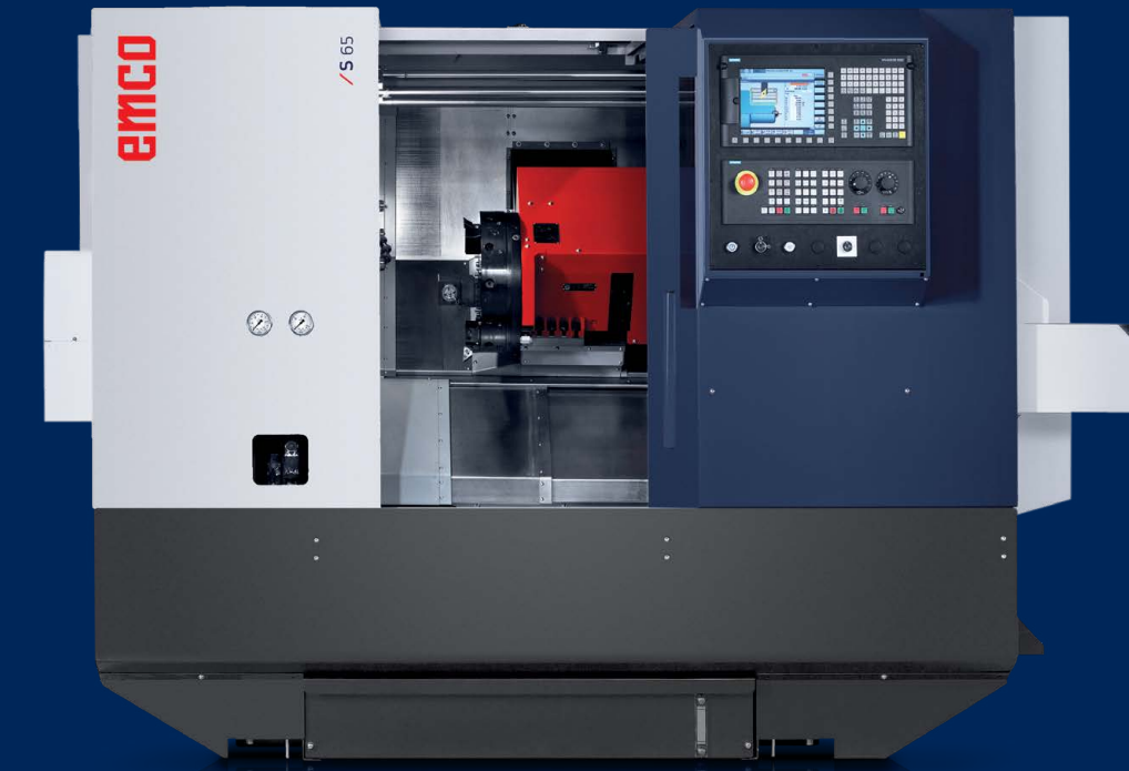
Machine with optional equipment

The compact CNC lathe with turn-mill turret is predestined for processing bar parts with a diameter of up to 65 mm and chuck parts of up to 310 mm. The main spindle features speeds of up to 4200 rpm and a main drive power of 18 kW. For shaft machining the machine is also available with an automatic tailstock. With an optimal accessibility the machine offers best conditions for the production of small lot sizes.